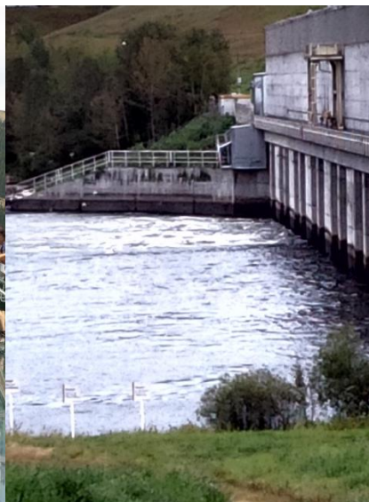
Job at E.B. Campbell Hydro Station